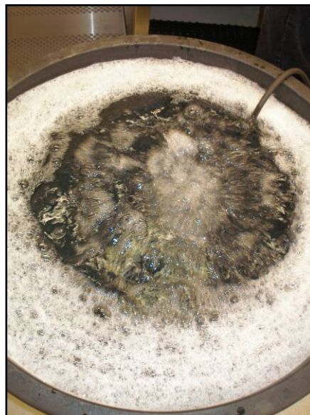
Figure 8. Wash tub with air hose to produce foaming action.