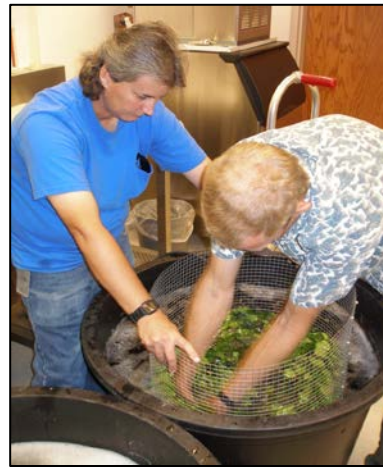
Figure 6. Cylindrical mesh basket in wash drum.