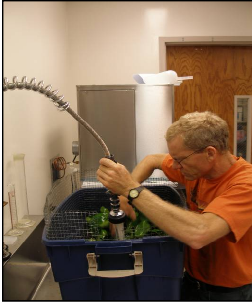
Figure 9. Rinse hose with potable water.