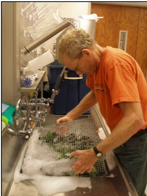
Figure 7. Mesh wash basket.