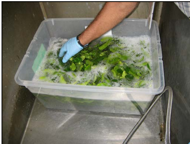
Figure 3. Leaf wash basin.