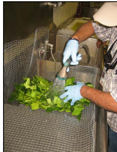
Figure 4. Rinse hose and mesh to support leaves.