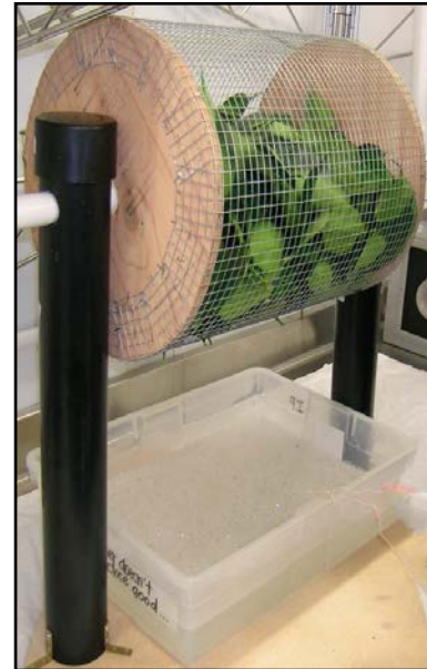
Figure 2. Raffle drum-type tumbler with catch pan.