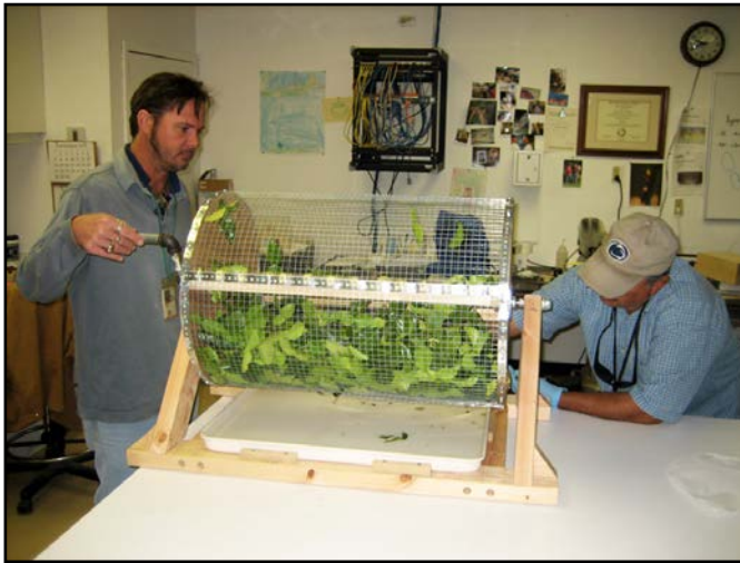
Figure 1. Raffle drum-type tumbler with catch tray.