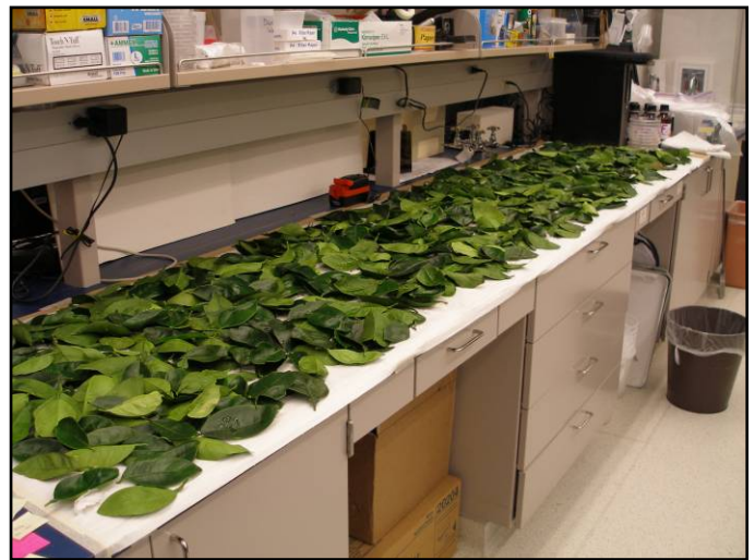
Figure 10. Leaves spread out to dry.